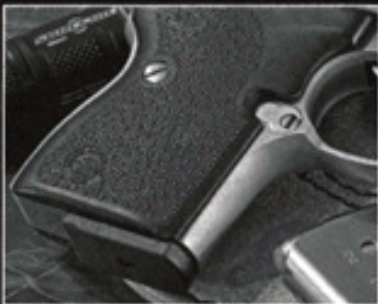
Black Hogue grips contrasted nicely with the stainless pistol.