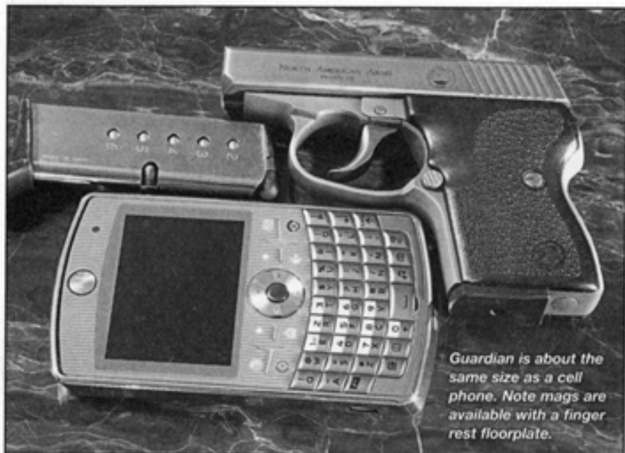
Guardian is about the same size as a cell phone. Note mags are available with a finger rest floorplate.

In a fight, you will not assume a perfect shooting stance and take your time to squeeze off perfect shots such as those fired in my tests. Yet knowing the gun shoots straighter than you can hold it is a nice place to start in terms of confidence. What's even more important on the street is that it goes "bang" every time you pull the trigger. Happily, the Guardian ran like a sewing machine, never failing to cycle or fire throughout my afternoon at the range. Such performance is all the more impressive when you consider that I couldn't manage to keep two fingers wrapped completely around the grip frame; my ring finger overlapped past the bottom of the Guardian's grip frame.