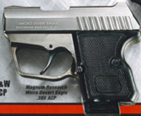
Magnum Research Micro Desert Eagle .380 ACP