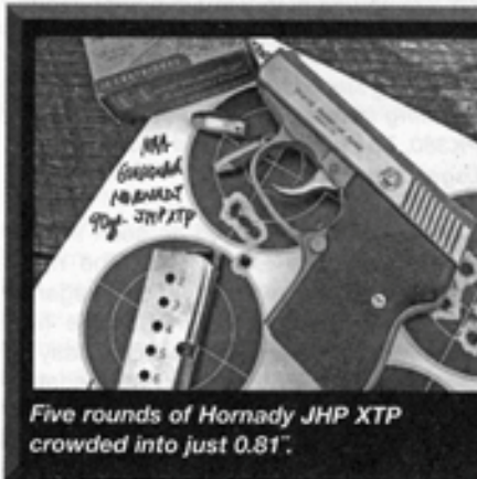
Five rounds of Hornady JHP XTP crowded into just 0.81".