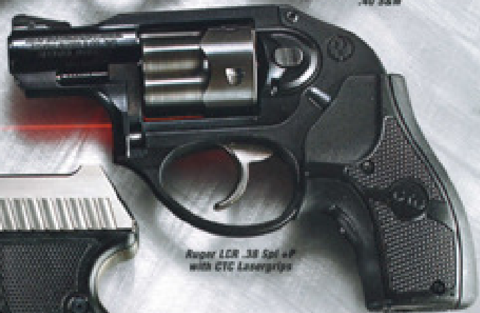
Ruger LCR .38 Spl +P with CTC Lasergrasp