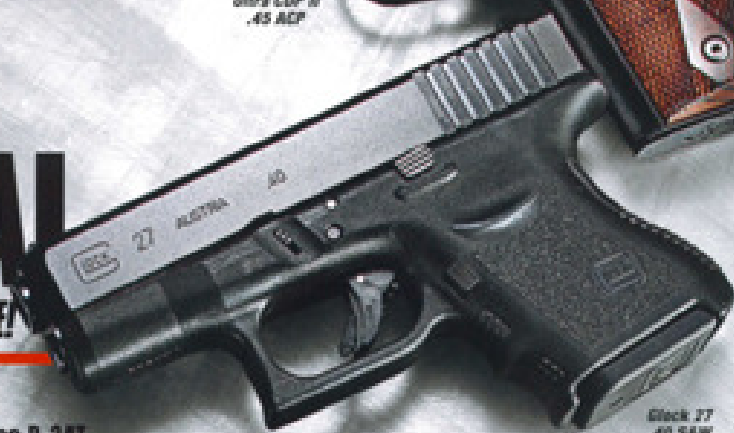
Glock 27 .40 S&W