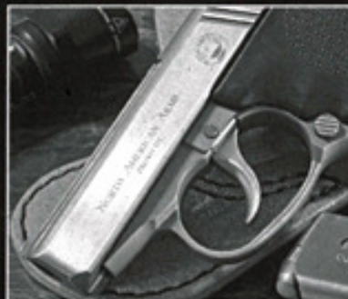
The Guardian's generous trigger guard works even with gloved hands.