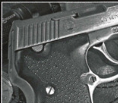
Note the slide stop, external extractor and bobbed hammer.

The frame is also from 17-4 pH stainless steel, but it's an investment casting. It's done by Pine Tree Casting, a subsidiary of Ruger, who are known for producing castings with maximum strength and integrity. The casting fixture/tooling was produced specifically for the .380 Guardian to render its one-piece frame/barrel, an arrangement that has proved highly efficient in guns of this size. Due to the current tremendous demand in the market for these small carry pistols other firms are currently handling some of the frame machining, but eventu-