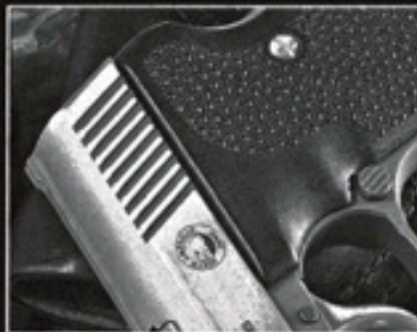
Rear sight was fixed square notch, and serrations are nicely done.