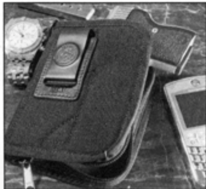
Nylon rug is yet another mode by which the Guardian can be carried.