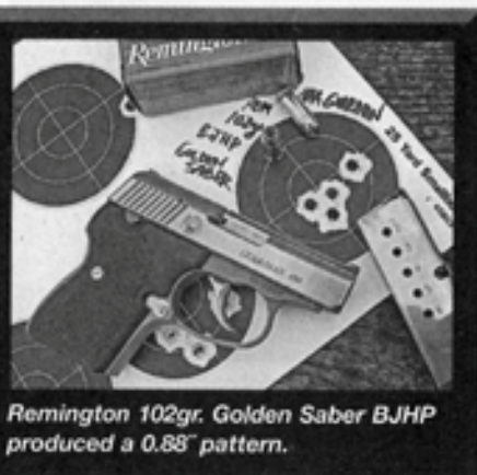
Remington 102gr. Golden Saber BJHP produced a 0.88" pattern.

NAA offers magazines with a finger rest to remedy this, as well as extended 10-rounders; but I've always rejected the idea of taking a gun whose primary strength is its compact size, then growing its profile by adding such magazines.