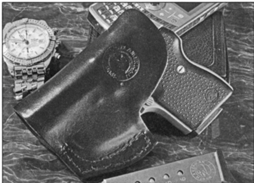
Author found IWB clip holster by Bell Charter Oak to carry securely and comfortably.