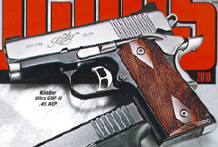
Kimber Ultra COP II .45 ACP

S&W M36 .38 SPL ■ CHARTER ARMS PINK LADY .38 SPL -P ■ LLAMA ESPECIAL .380 ACP NAA GUARDIAN .380 ACP ■ KIMBER ULTRA COP II .45 ACP ■ RUGER LCR .38 SPL -P CUSTOM SPRINGFIELD EMP 9mm ■ KEL-TEC P-3AT .380 ACP ■ PARA CARRY 9mm ■ MORE!